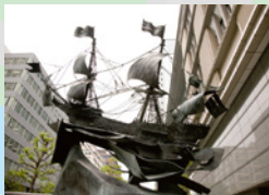
6 Outer Gardens of the Imperial Palace