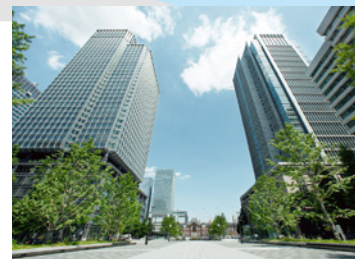
5 Wadakura Fountain Park