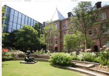
7 Meiji Seimei Kan Building