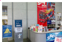
Meeting Place 1 Fl. Mitsubishi Building Next to the Skybus counter (2-5-2 Marunouchi, Chiyoda-ku)