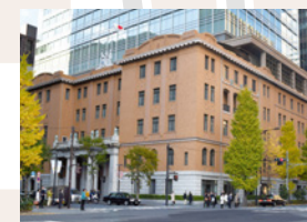
3 Industry Club of Japan